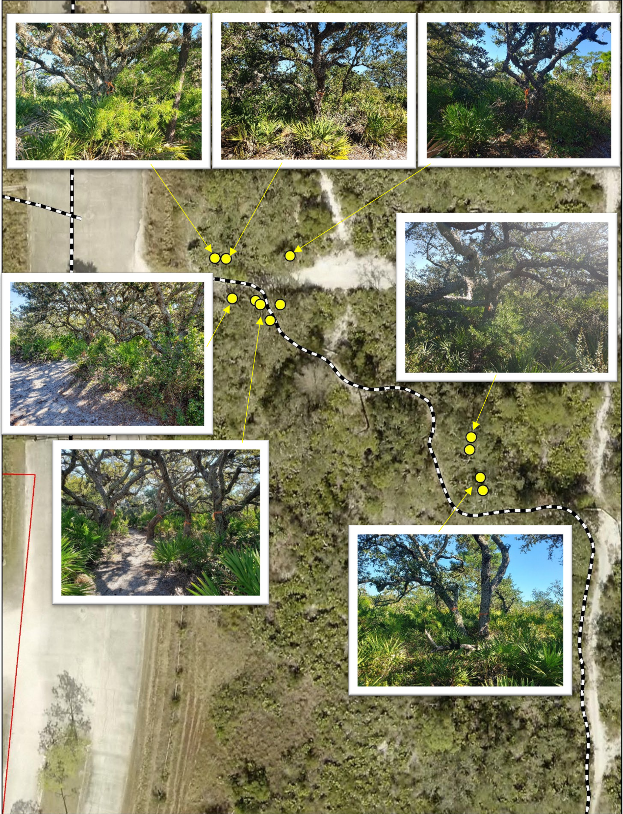
Fig. 2 - Area A – 12 Oaks