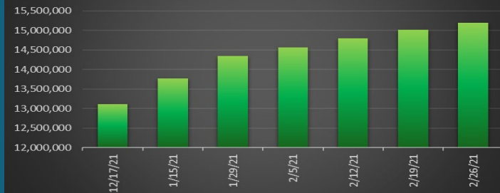
Aging Matters Meals Distributed