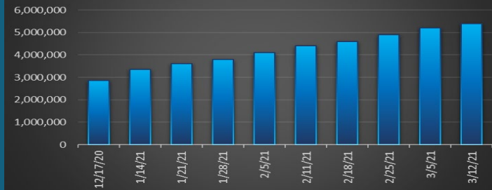
Second Harvest Food Bank Meals Distributed