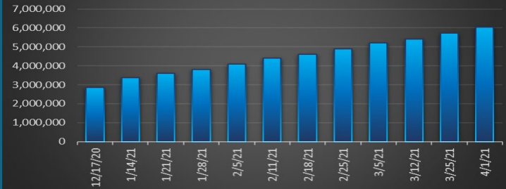
Second Harvest Food Bank Meals Distributed