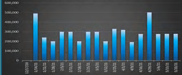
Second Harvest Food Bank Pounds of Food Distributed