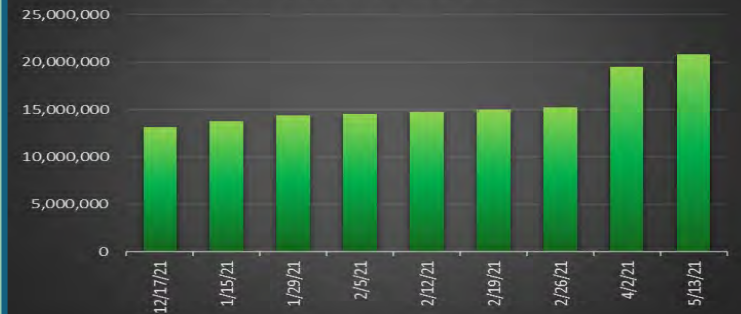
Aging Matters Meals Distributed Weekly