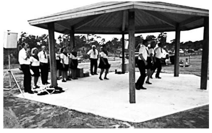
Rocky Water Cloggers perform at Malabar Day.

selection of mixed class vehicles for the car show. Trophies were awarded for First and Second place and a plaque for the People's Choice.