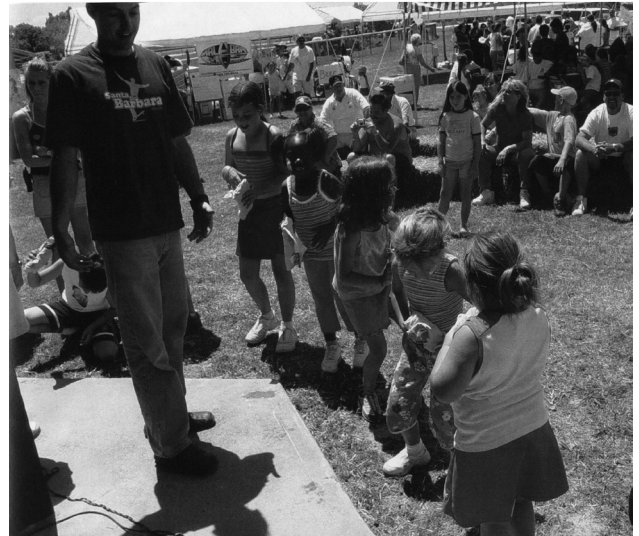
The kids had fun trying to unwrap frozen t-shirts